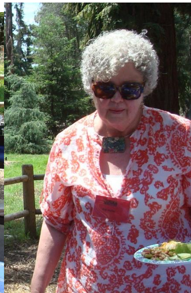
A great day was had by all. Artists make the best friends!