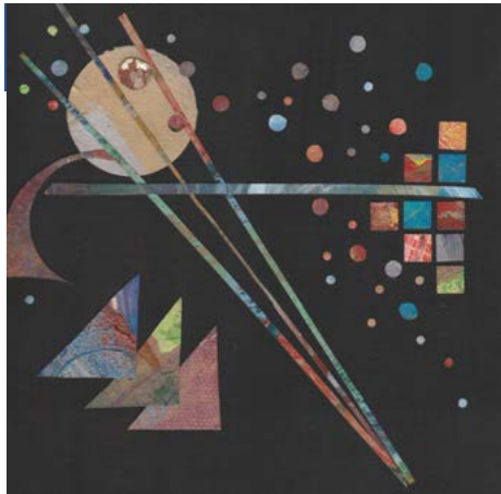
10" x 10" collages: (above) "Star Shower"; (below) "Southwest Dawn"; (far right) 7" x 5": "Pink Moment"