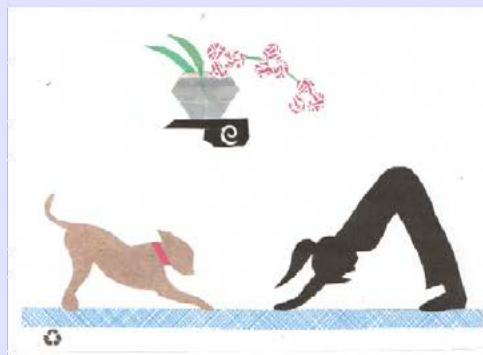
Bottom left to right: 5" x 5" "Orchid Window"; 5" x 7": "Down Dog" and "Repeat After Me"