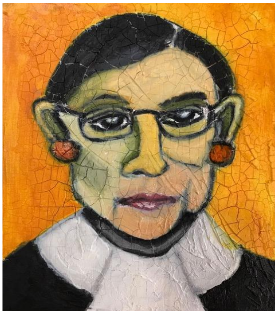
Elizabeth U. Flanagan, "Notorious RBG", mix