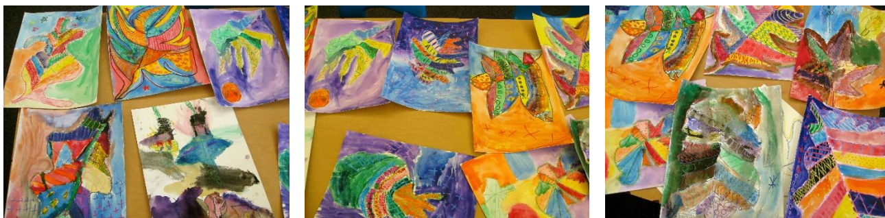
The children were great, and they produced a lot of wild looking Fall leaves!