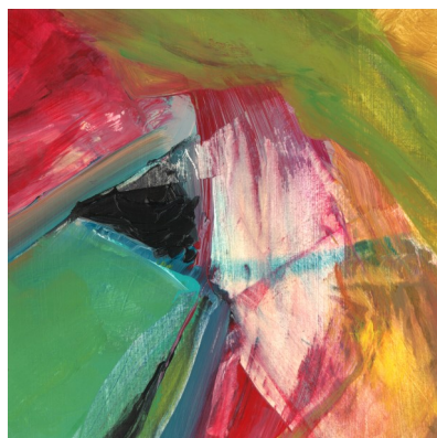
Untitled SBS 79