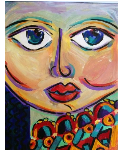
From a series of Faces by Mooneen Mourad (above)