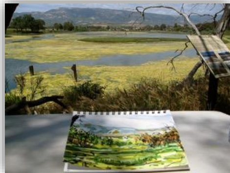
May Sketch-Out Devereux Slough