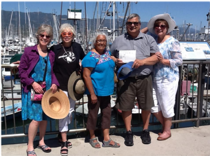
Some happy sketchers from April's Sketch-Out

P.O. Box 435 Goleta, CA 93116 805.898.9424 www.tgvaa.org