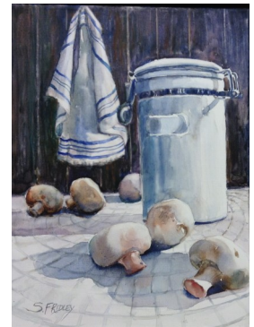
Mushrooms etc. By Sue Fridley