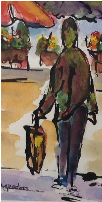
Farmer's Market by Mary Peeters

Please share some news about your shows, art sales, awards received, publications you are in, any art activities, jpeg images or any information that might be of interest to us all!