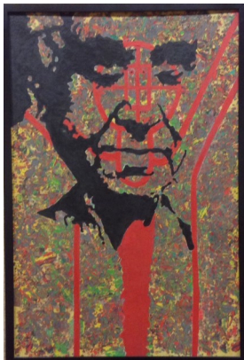
Mixed By Loren Nibbe