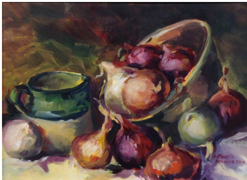
Farmer's Market