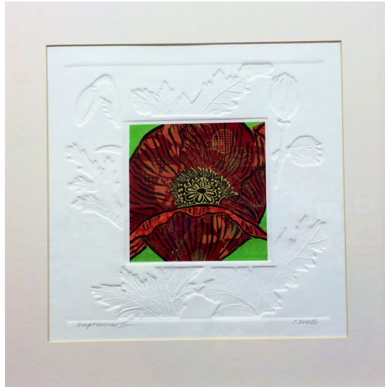
Jerilynne Nibbe Impressions III woodcut chine collé