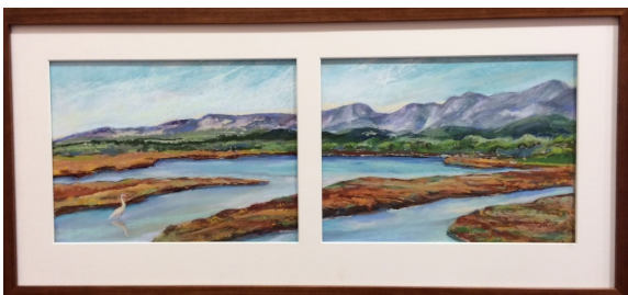
Carpinteria Salt Marsh