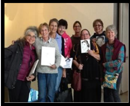
January's Sketch-out Artist and Sketches