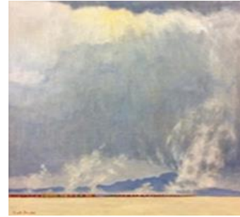
Rick Drake "Across the Salt Flat"