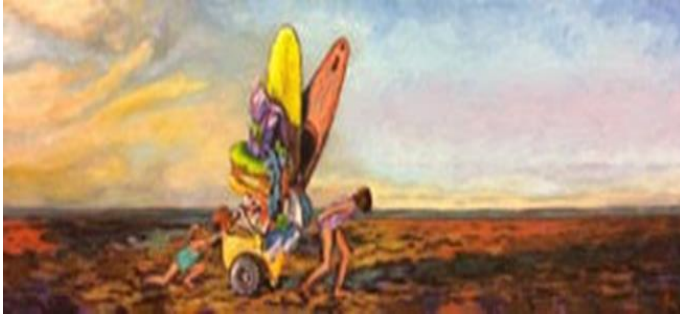
Frances Reighley, "Sunrise Beach Setup"