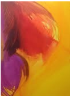
Pumpkin Picker by Atila Danila