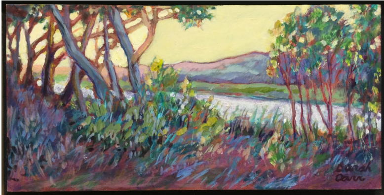
Devereux Sunset