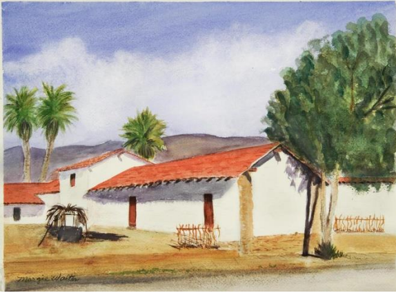
Marjory Water, "The Presidio with Cart", giclée

Cottage Hospital just purchased 2 giclees from Marjory Walter's original paintings to go in one of their new buildings. These will make a total of 7 giclees they've purchased, since they bought 5 others back in 2011.