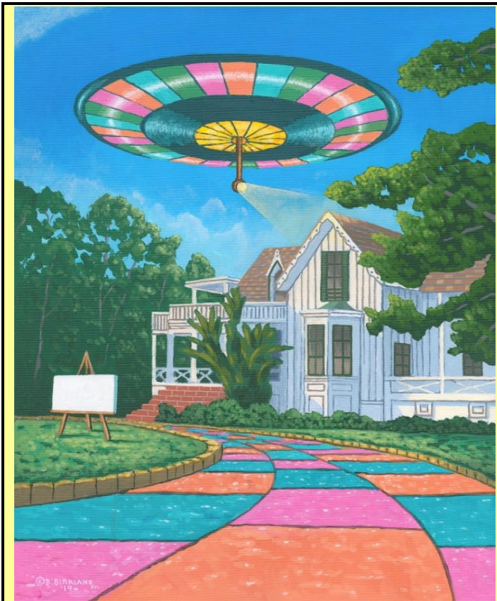
Painting by Bruce Birkland