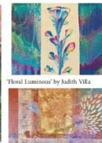
'Floral Luminous' by Judith Vile