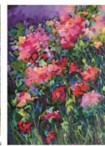
'Vivacious' by Lynn Humphrey