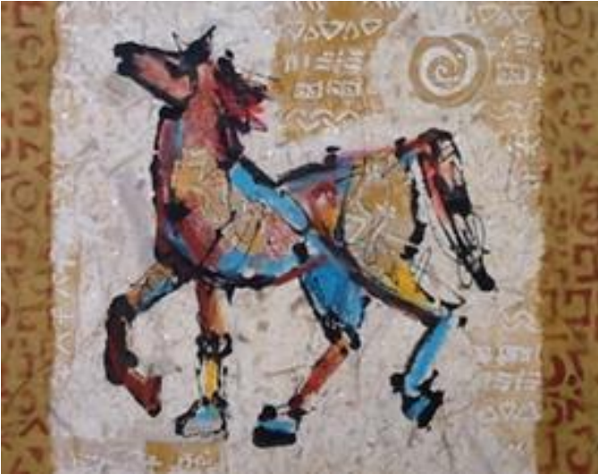
Holly Hungett's "Painted Pony"

Holly Hungett is pleased that 2 of her pieces were accepted into the PARADE OF HORSES, "Painted Pony", hand colored monotype collage, and "Wild Mustang", hand colored monotype with handmade paper at the Casa Gallery in August. "Painted Pony" was also included the announcement for the show.